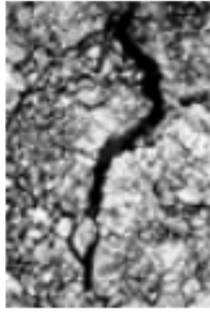
A Basic Flaw

The Principle of Limitation: Every point of view is wrong until there no longer remains a point to view from.